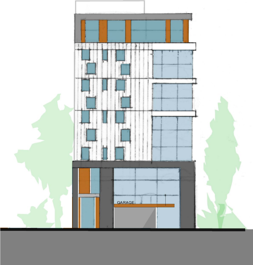
ELEVATION - NORTH