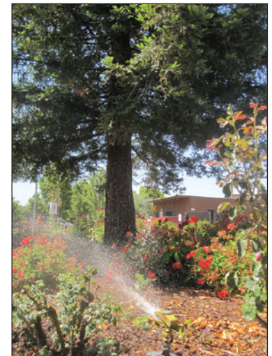
A healthy redwood tree irrigated with recycled water.

Water quality reports, for both potable and recycled water, are typically posted on your Water Retailer's website. Because all water sources vary over time, water is analyzed frequently. If you are currently using South Bay Water Recycling (SBWR) water, test results may be found at www.sanjoseca.gov/sbwr