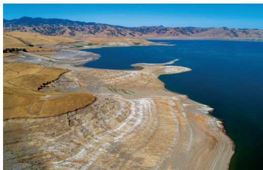
San Luis Reservoir