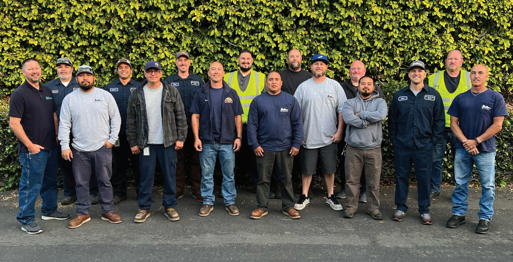
City of Mountain View water operations and distribution staff