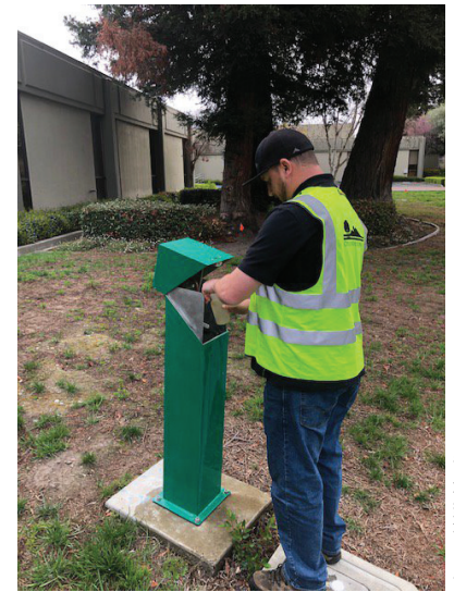
City staff collecting a water sample

Chloramine Disinfectant: Drinking water provided to the City of Mountain View by the SFPUC and Valley Water is disinfected using chloramine. Although people and animals can safely drink chloraminated water, chloramine must be removed or neutralized for some special users, including some business and industrial customers, kidney dialysis patients, and customers with fish and amphibian pets. More information on chloramine is available at EPA.gov/dwreginfo/chloramines-drinking-water .