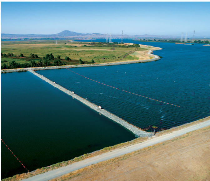
Sacramento-San Joaquin Delta

Valley Water's three water treatment plants provide multiple barriers for physical removal of contaminants and disinfection of pathogens. Mountain View receives water from the Rinconada Treatment Plant in Los Gatos.