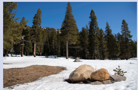
2021 Sierra Nevada snow survey site

The 2022 water year started with record-breaking dry conditions, and the wet season ended with below average rainfall. The statewide snowpack for April 1 was 38 percent of normal and resulted in the lowest buildup of snowpack in seven consecutive years. As the drought persists, Mountain View and its wholesale suppliers encourage customers to continue using water wisely by limiting irrigation usage and fixing water leaks. For current information and a complete list of water use restrictions, visit MountainView.gov/Drought .