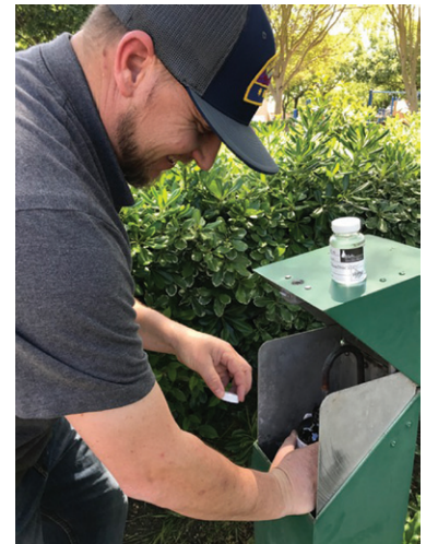
City Staff collecting a water sample

Drinking water provided to the City of Mountain View by the SFPUC and Valley Water is disinfected using chloramine. Although people and animals can safely drink chloraminated water, chloramine must be removed or neutralized for some special users, including some business and industrial customers, kidney dialysis patients, and customers with fish and amphibian pets. More information on chloramine is available at: www.epa.gov/dwreginfo/chloramines-drinking-water .