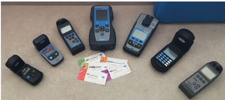
Water quality test equipment

The current rule (UCMR 4) was published in December 2016 and requires monitoring of 30 chemical contaminants between 2018 and 2020 using EPA-prescribed testing methods. Mountain View sampled for the required UCMR 4 constituents in 2018 and had no detections.