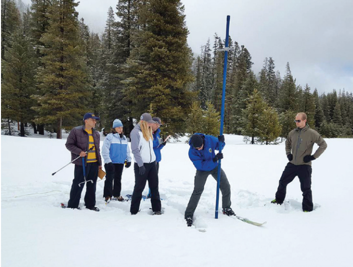
Performing the April snow survey

Snowpack from the Sierra Nevada is the primary source of water for most of California. As snow melts in the Sierras it runs off into the State's river systems, refilling reservoirs and recharging