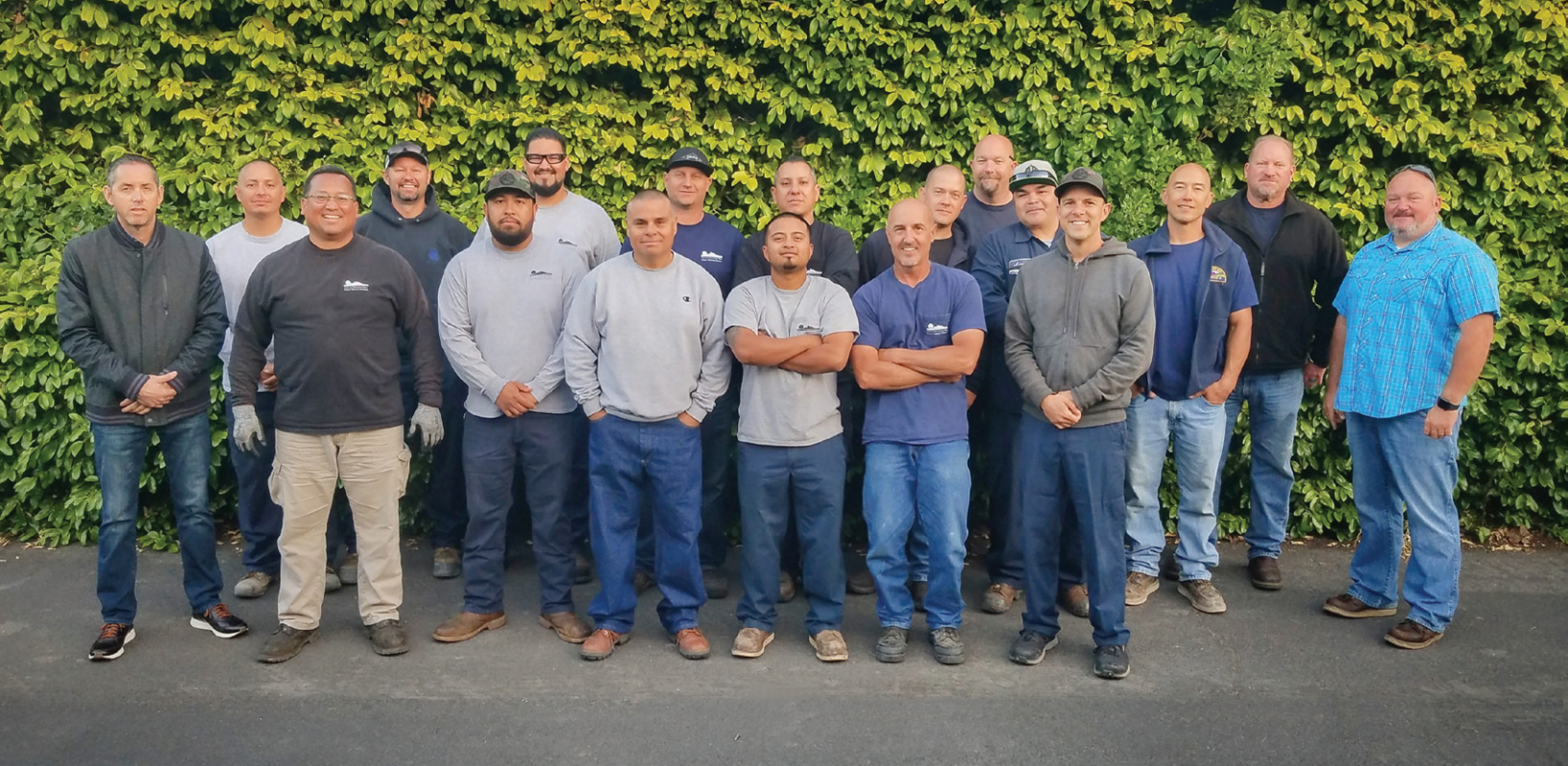
City of Mountain View water operations and distribution staff