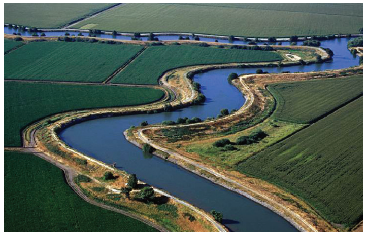
The Sacramento-San Joaquin Delta

The San Francisco Bay / Sacramento-San Joaquin Delta Estuary is a complex series of rivers, wetlands, and bays that interact to carry fresh water from the Sierra Nevada to the Pacific Ocean. California's two largest rivers, the Sacramento and San Joaquin, collect water from dozens of tributaries before combining near the City of Sacramento. Increased salinity, long-term declines in fish populations, and other factors recently prompted the State Water Board to adopt a new Bay Delta Water Quality Control Plan. The new plan requires water agencies to reduce diversions from tributaries of the San Joaquin River during certain months. This action has sparked controversy throughout California and several lawsuits have been filed in opposition of the plan. Despite this conflict, officials are working to negotiate a voluntary settlement that will address the State's concerns in a manner acceptable to